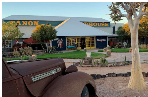
Canon Road House